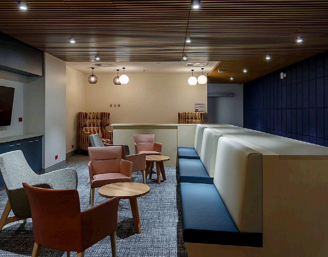
MATER HOSPITAL, TOWNSVILLE PEDDLE THORP